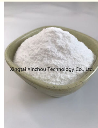
Xingtai Xinzhou Technology Co., Ltd.